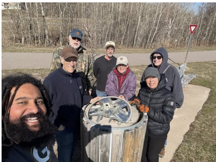
April 26th Carp River clean-up gang:

New Member Class- 6:15pm join us after Tacos and hear about Prince of Peace and let us know more about you.